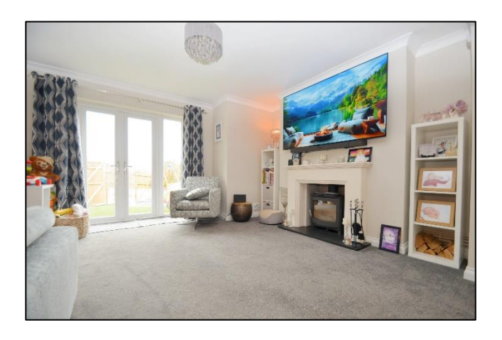
STUDY/OFFICE AREA 3.15m (10'4") x 2.08m (6'10") Space for a desk, telephone point, opening to: