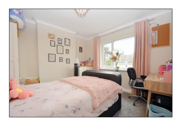
BEDROOM THREE 2.18m (7'2") x 1.70m (5'7") Double glazed window to side, radiator.

Double glazed window to front with views over the garden and across to the open countryside, radiator, TV point.